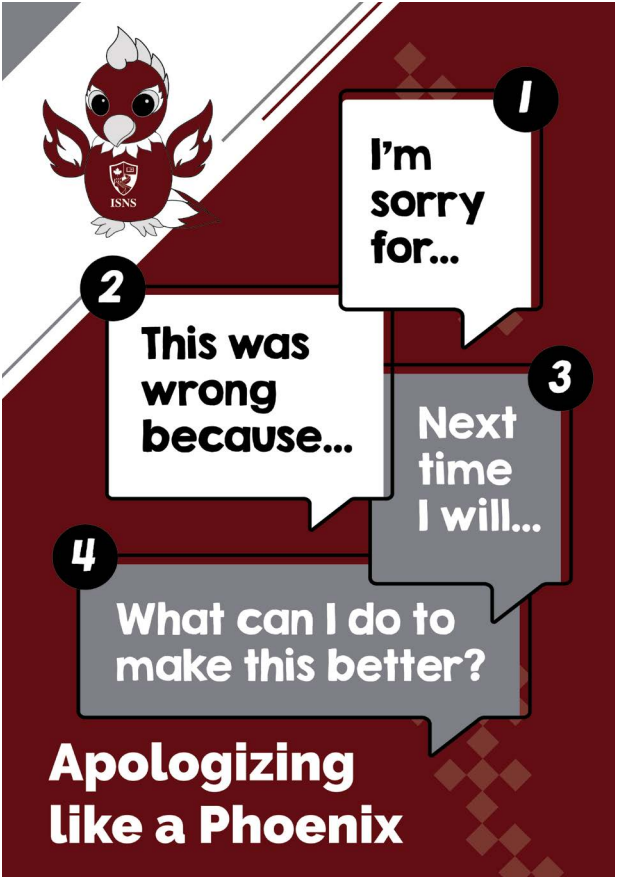
3. Phoenix Apology:

Children can use this message to express their feelings. They can listen to other people involved in a conflict share their feelings, as well. This tool builds empathy and understanding of perspective.