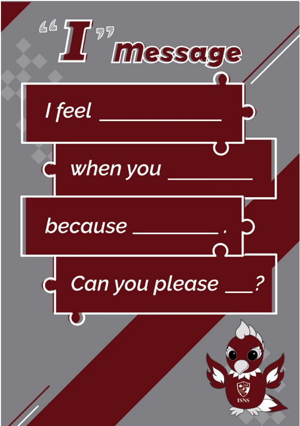
2. I Message:

Children can use this tool to find alternatives to harmful expressions of sadness, anger or frustration.