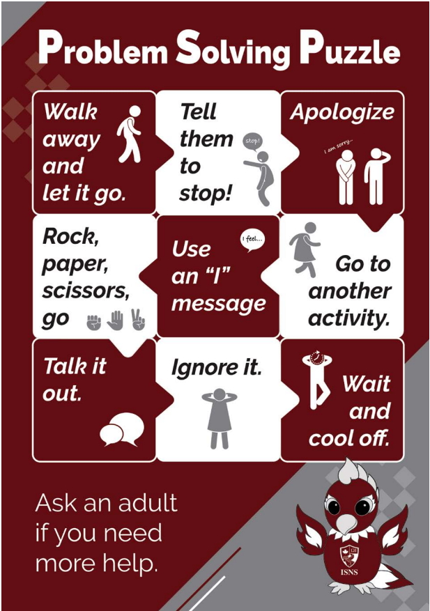
1. Problem-Solving Puzzle:

These are key tools that we use at school, and we encourage ISNS families to use them at home, as well: